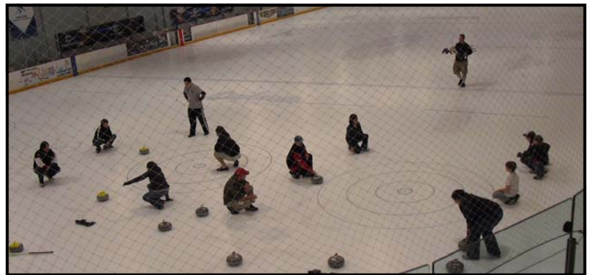
The on-ice portion of the clinic gave participants a chance to actually "curl" after learning the basics. Below, new curlers get their chance to deliver the stone to the other end. The stones, made from granite, weigh 42 pounds each.